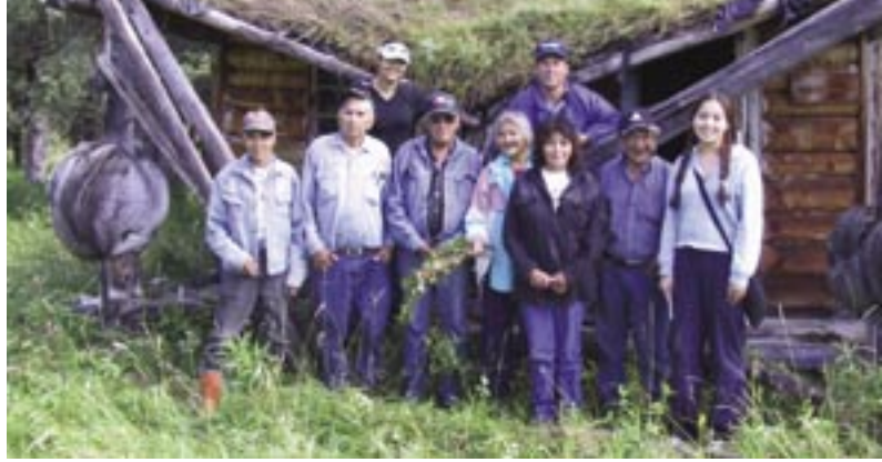
Participants in the Prophet River Traditional Plant Study.

Dahke Community Projects Inc. dahke@pris.ca