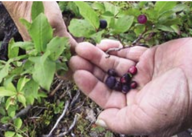
Prophet River Traditional Plant Study.